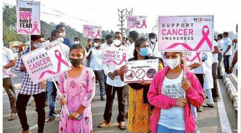
Spreading the message: Youngsters taking part in the cancer awareness walkathon in Vijayawada on Thursday.